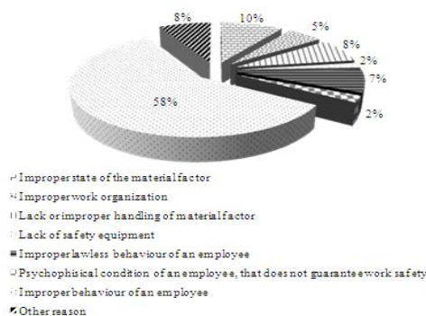
Figure 2. Causes of accidents at work in the year 2010.